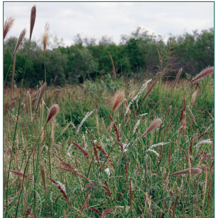
Figure 1. Native prairie.

PLS is a measure of the amount of weight in a bag of seed that is viable. It is calculated by multiplying the purity of the seed lot by the percent viability of the seed lot. For purchased seed, check the seed bag tags for purity, percent pure live seed (PLS), the kind and amount of contaminant weed or other crop seeds, and the results of a tetrazolium chloride test (TZ, a test