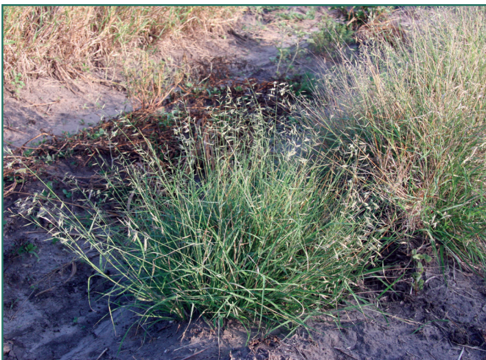
Figure 3. Slender grama, an early-successional plant.

Many generic, or pre-set, native seed mixes available commercially are poorly suited for South Texas. For example, many native prairie mixes of familiar native grasses such as little bluestem, switchgrass, big bluestem, and Indiangrass are