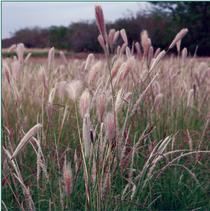
Figure 5. False Rhodes grass, a late successional plant.

Typically, a native seed mix should include only 25 percent of these late-successional plants. Examples include prairie acacia, big bluestem, little bluestem, sideoats grama, yellow Indiangrass, multiflowered false rhodesgrass, false rhodesgrass, big sacaton, Canada wildrye, and orange zexmenia.