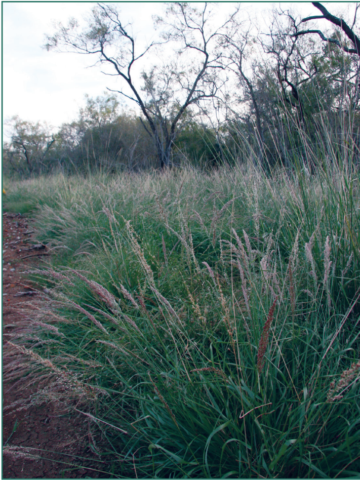
Figure 4. Pink pappusgrass, a mid-successional plant.

1½ to 2 years before the planting date, and eliminate the seed-bank in the soil. Methods include repeated cultivation, and cultivation with repeated herbicide applications.